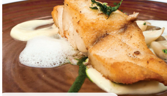
Roasted red snapper at Spago